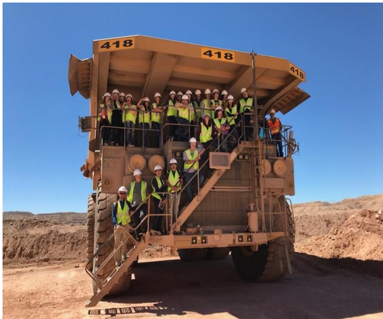
The 9th grade toured the Tyrone mine. Learning about where we come from