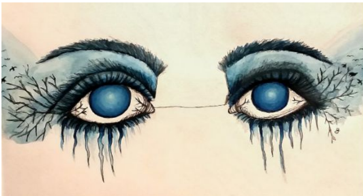
Rachel, 10th grade