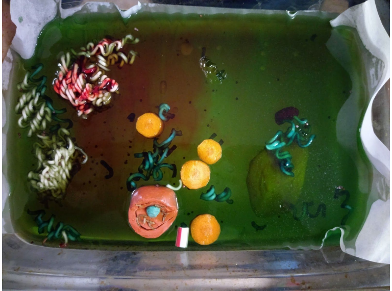
Samera's cell is multimedia.