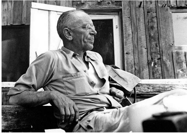
Aldo Leopold